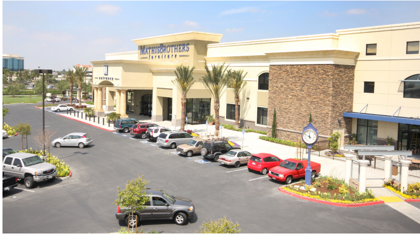
ONTARIO MATHIS BROTHERS SUPERSTORE