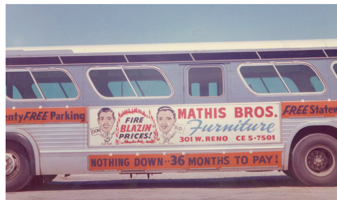
1960's MATHIS BROTHERS ADVERTISEMENT