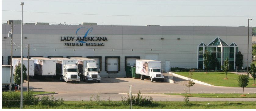
LADY AMERICANA FACTORY, LOCATED IN OKLAHOMA CITY

In October 2001 the new factory, the most technologically advanced in the country at the time, rolled out the first mattress. Known for comfort and value, Lady Americana has experienced incredible growth and become one of the most popular brands worldwide.